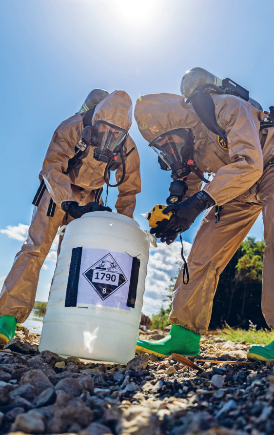
ABOVE: Chemical, biological, radiological and nuclear (CBRN) hazard technicians.

its network of contacts and keeps it up to date. The purpose of the cell is to identify civilian factors of operational significance. 4 They liaise with NATO civil-military cooperation (CIMIC) units; leaders of the local armed forces and law enforcement agencies; influential economic, financial and political leaders; representatives of local society and refugees; leaders of governmental, non-governmental and international organizations; and journalists.