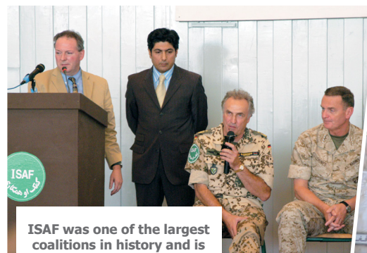
ISAF was one of the largest coalitions in history and is NATO’s most challenging mission to date. At its height, the force was more than 130,000 strong, with troops from 51 NATO and Partner Nations.

When I went to Kabul, I had been SHAPE’s Chief of Public Affairs, the first civilian to hold the post, but within a few months of my return, I was SHAPE’s Chief Strategic Communications, the first StratCom position anywhere in NATO. The circumstances of the post’s creation had been a little messy, and the job requirement was somewhat vague, but the timing was right, and the need for change was clear. And not just to me. I am proud to have played a part in advancing StratCom within NATO, but it was as part of a team. The ARRC left Afghanistan even more convinced of the value of StratCom, as did a succession of headquarters and individuals. They arrived in Afghanistan with the traditional approaches, and left with different attitudes and advocating reform. Existing policy gave little guidance, and often added quite a lot of confusion and contradiction to the movement for change, but