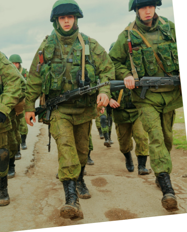
LEFT: Russian soldiers in Perevalne. In early 2014, Russia illegally seized the Crimean Peninsula from Ukraine.