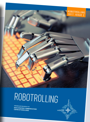
LEFT/ABOVE: NATO StratCom Centre of Excellence, "Robotrolling 2017/2" can be downloaded at the following link: https://www.stratcomcoe.org/robotrolling-20172