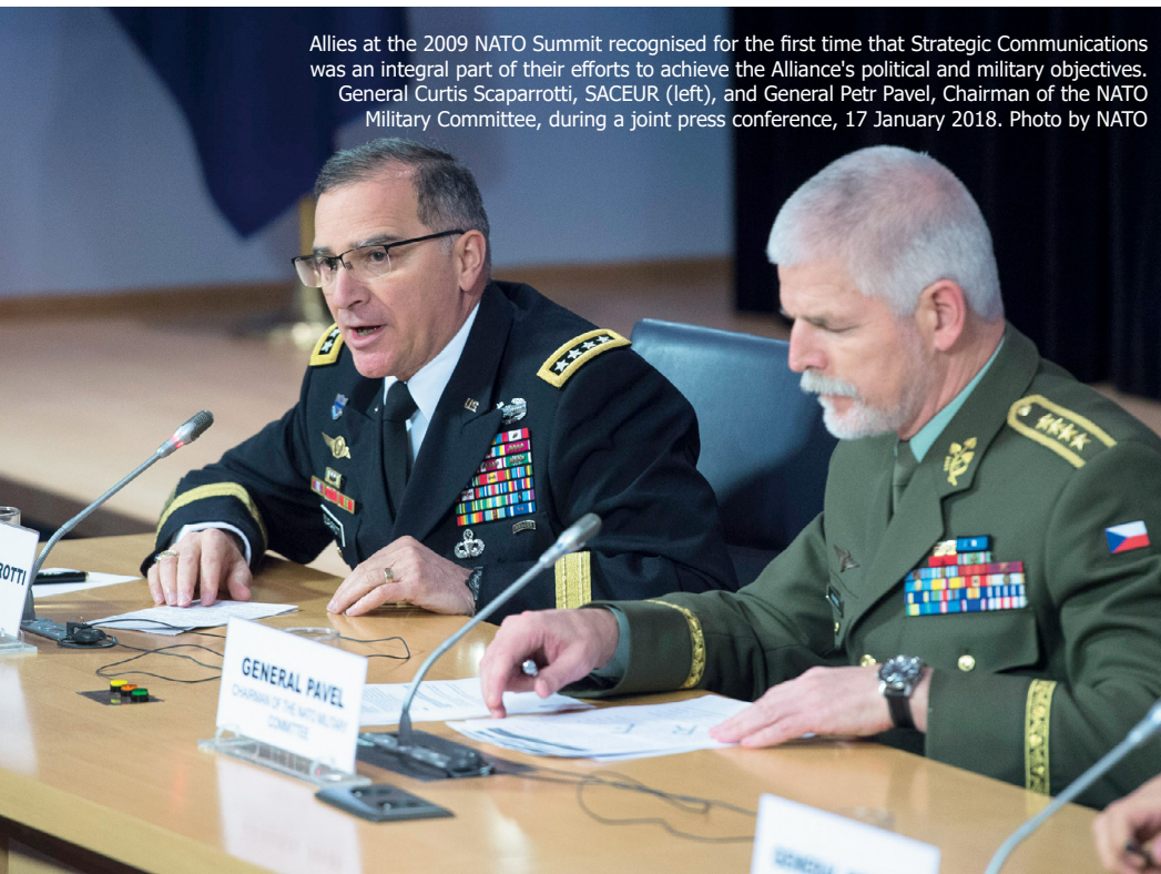
Allies at the 2009 NATO Summit recognised for the first time that Strategic Communications was an integral part of their efforts to achieve the Alliance's political and military objectives. General Curtis Scaparrotti, SACEUR (left), and General Petr Pavel, Chairman of the NATO Military Committee, during a joint press conference, 17 January 2018.

“It will never happen—never.” The statement was made with a tone of certainty. I remember the conversation last year with clarity. The “it” was MC 0628, the draft NATO Military Policy on Strategic Communications (StratCom), centrepiece of an intense struggle on how NATO communicates in the Information Age. StratCom mattered, and the comment reflected the strong feelings as well as arguments over StratCom and what it meant to those in the communication community, but the officer was wrong. A few months later, 0628 went through, approved by the Nations, and at last NATO’s military finally have a policy fit for the challenges of a security environment in which information is a fundamental component.