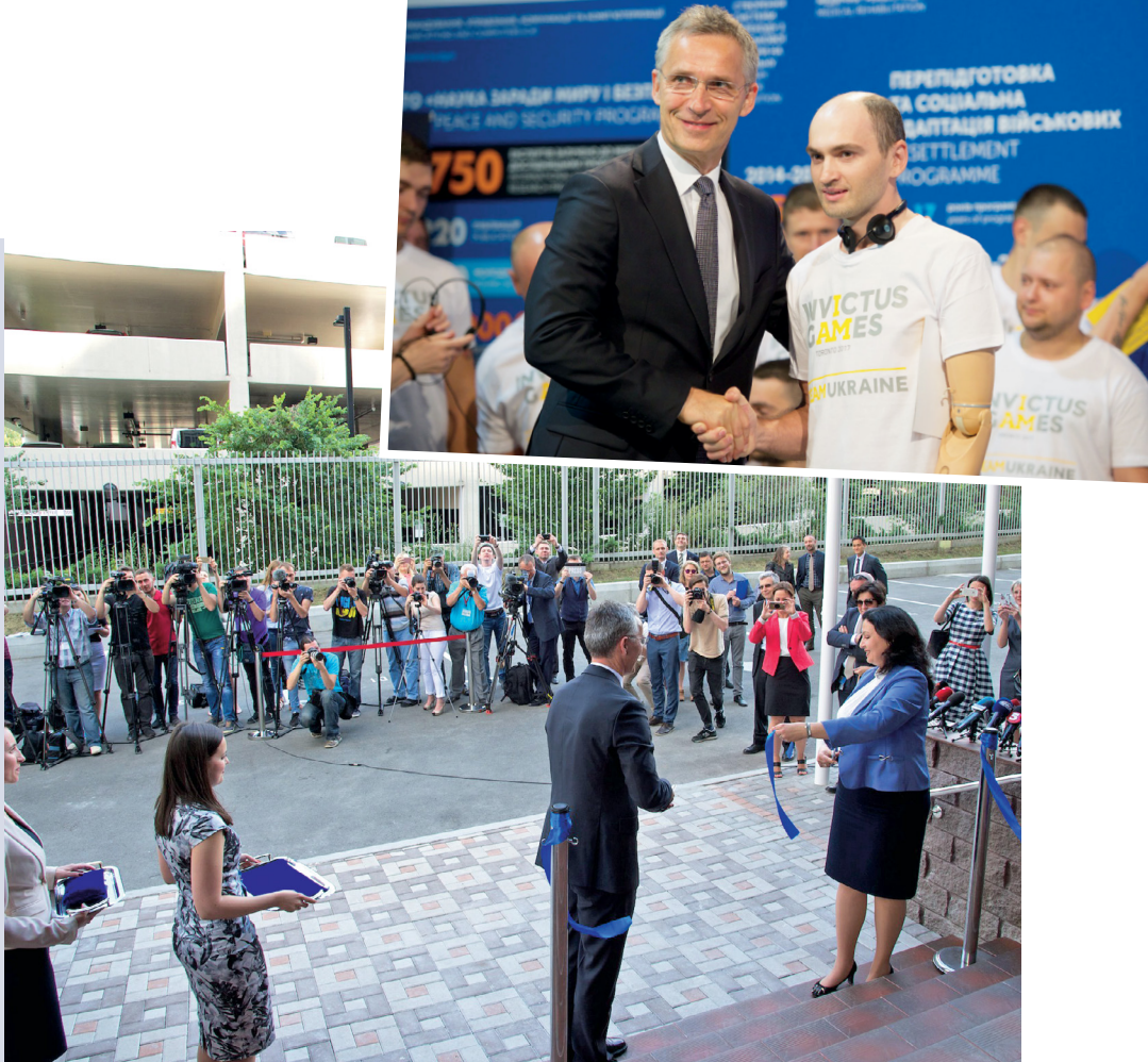
ABOVE: 2017 was the third anniversary of the illegal annexation of Crimea. Picture shows inauguration of the new premises of the NATO Representation to Ukraine by NATO Secretary General Jens Stoltenberg and the Vice Prime Minister for European and Euro-Atlantic Integration, Ivanna Klympush Tsintsadze, 10 July 2017. INSET: Jens Stoltenberg presents certificates to the Ukrainian Team participating in the Invictus Games. The word "Invictus" is Latin for "unconquered" and embodies the fighting spirit of the servicemen and women who became wounded, injured or ill fulfilling their duties on the battlefield. (invictusgames.in.ua/en).

PERCEPTION BECOMES REALITY: The "Mouth of Truth" (Bocca della Verità), is a marble mask in Rome, Italy, which is said to bite off the hand of anyone not telling the truth.