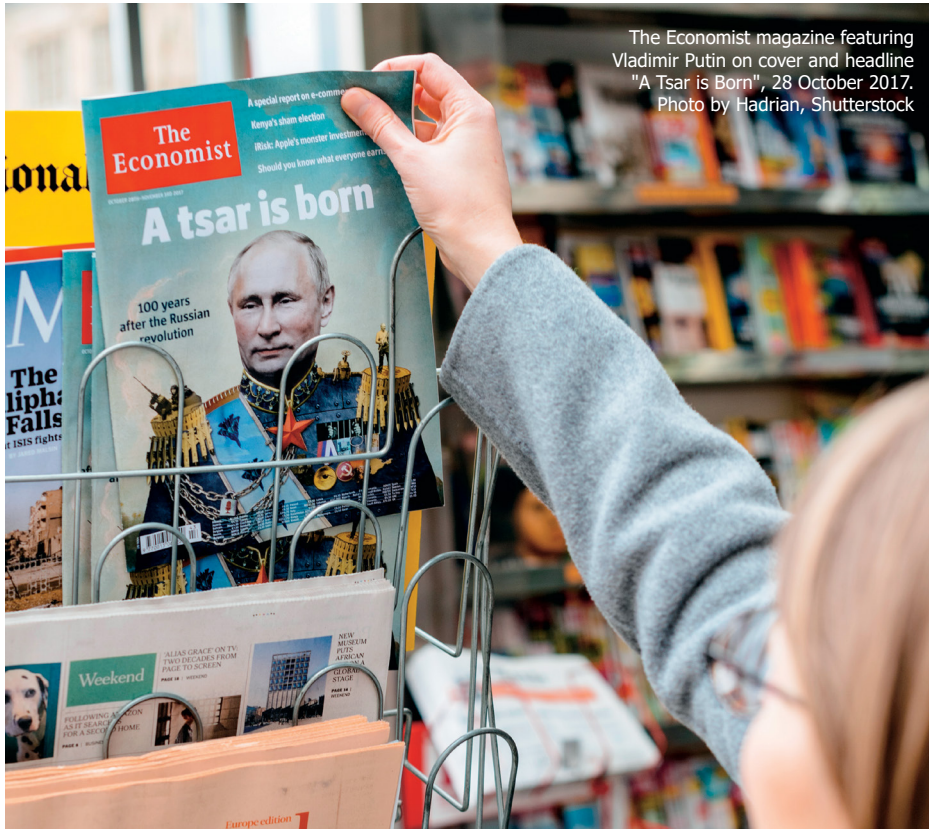
The Economist magazine featuring Vladimir Putin on cover and headline "A Tsar is Born", 28 October 2017.