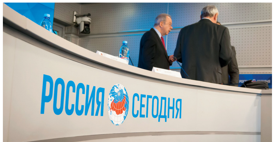
BELOW: Journalists of the state-owned "Russia Today" TV Channel. General Gerasimov, Russia's Chief of the General Staff, wrote on modern warfare in 2013, "the new means of conducting military operations have appeared that cannot be considered purely military."

The same tactics were tried to initial effect in Eastern Ukraine, but the shock effect had worn off and the response of both other countries and Ukraine also showed that the information line of effort is not enough on its own if the other objective circumstances are not also sufficiently aligned. Critically they underestimated Ukraine, the same narratives and desires that had driven the EuroMaiden—itsself an in-