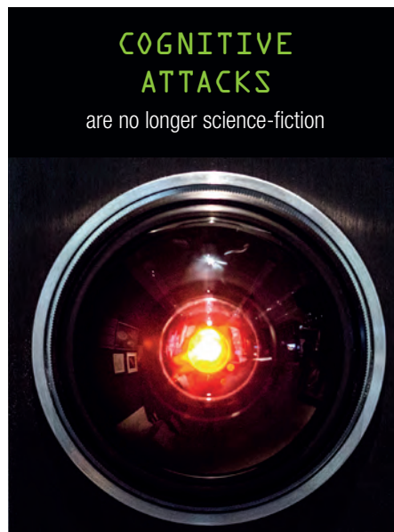
HAL 9000, a sentient computer from the film "2001: A Space Odyssey."

In April 2013, U.S. President Obama announced the launch of the White House initiative Brain Research Through Advancing Innovative Neurotechnologies (BRAIN). Its goal was to support innovation that would further our understanding of the brain; Russian commentators perceived it as a project to "hack the human brain."